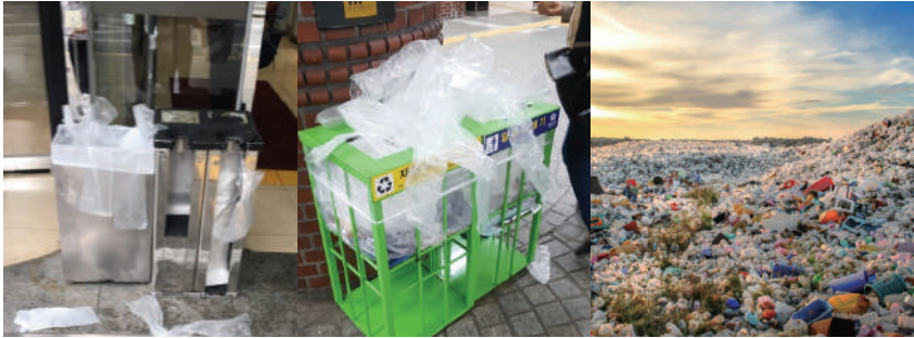
▲ It's difficult to recycle plastic umbrella bags because they get wet