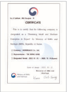
Promising Enterprise In Export