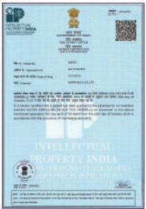
3D Pad Patent registered in India