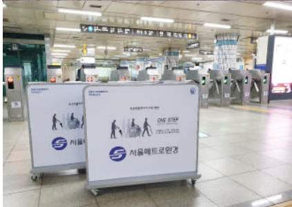
Rain Eco 2S installed at spacious places like subway stations and Seoul City Hall.