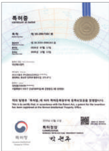
No. 10-2057182 3D Pad Patent registered in Korea