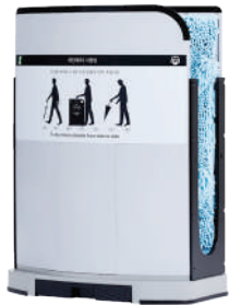
Rain Eco 3 for places with limited spaces like restaurants, cafes and commercial buildings