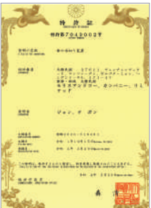
3D Pad Patent registered in Japan