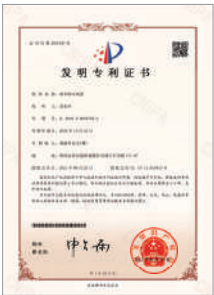
3D Pad Patent registered in China