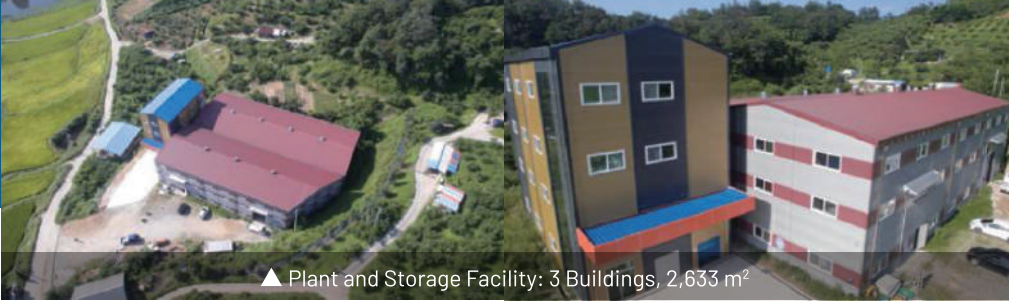
▲ Plant and Storage Facility: 3 Buildings, 2,633 m 2

MORRIS&CO is an eco-friendly company that puts environment first.