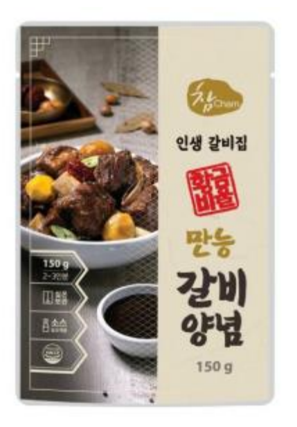
Galbi Sauce 150g