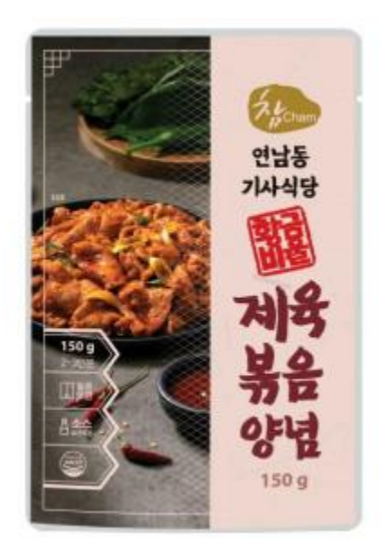
Stir-fried pork 150g