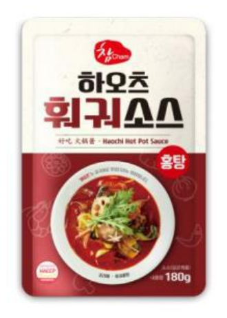
Hot Pot Red sauce 180g