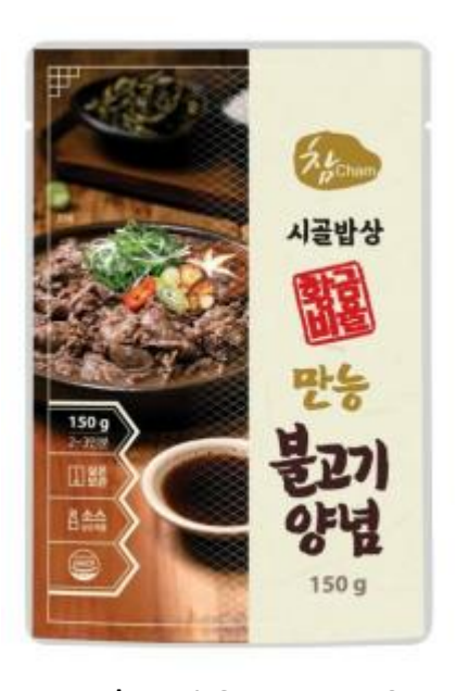
Bulgogi Sauce 150g