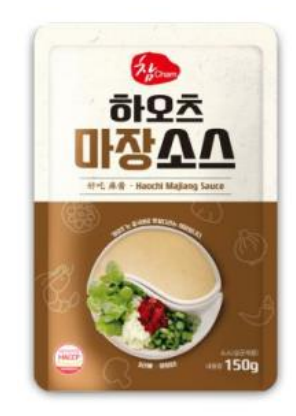
Majang sauce 150g