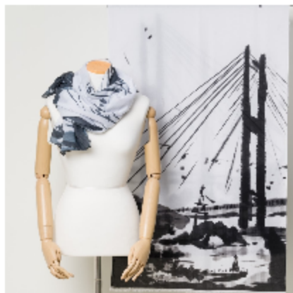
The memories of trip