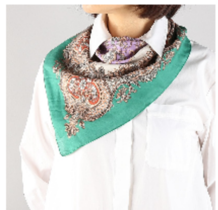
Tencel 100% Square Scarf