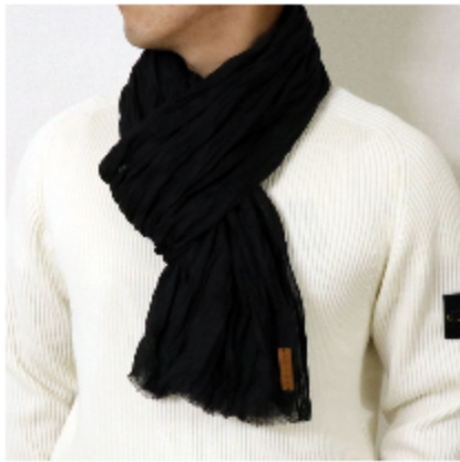
Plain Crinkle Scarf