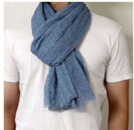
Pin-checked Prinkle Scarf