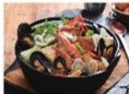
Seafood fish cake soup