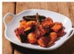
Boneless monkfish bulgogi