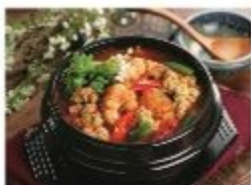
Frozen Pollack soup