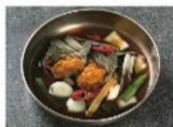
Soy sauce marinated Chinese mitten crab