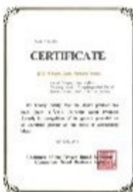
Receives a HI-Seoul excellent commodity brands award

As a result of exertion to sanitary, strict quality control and its own research development, Yongdong Seafood Co., Ltd holds over 10 kinds of home and foreign patents and application.