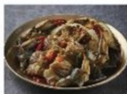
Soy sauce marinated blue crab (from USA)