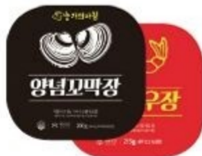
'농가의 아침' OEM