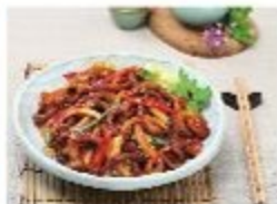
Stir-fried spicy octopus