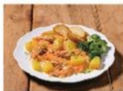
Garlic butter shrimp