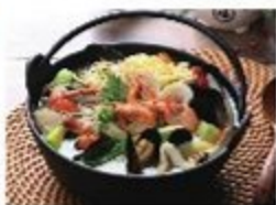
YoungDong-Nagasaki spicy seafood noodle soup