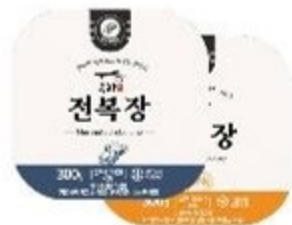
'부자 시리즈' OEM