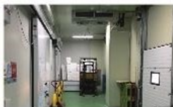
Raw materials and products custody warehouse 2

The best temperature is constantly kept through an artificial intelligence sensor.