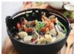
Assorted shellfish soup