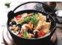
Mixed Seafood and vegetable with spicy crust of overcooked rice soup