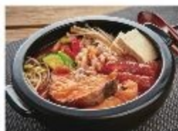
Spicy codfish soup