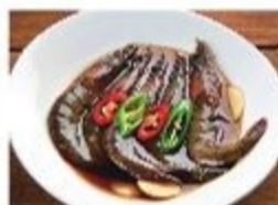
Soy sauce marinated shrimp