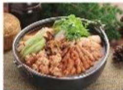
Spicy fish roe soup