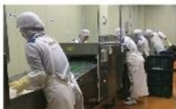
Raw materials processing line

It conducts thorough management against an alien substance. It makes assurance on food safety doubly sure