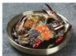
Soy sauce marinated swimming crab (암게)