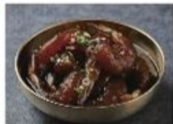
Peeled soy sauce marinated Shrimp