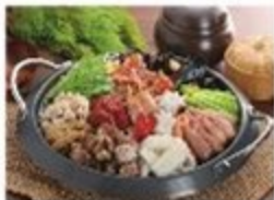
Assorted seafood soup