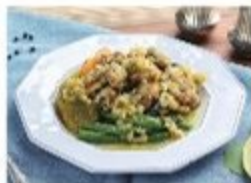
Garlic butter scallops