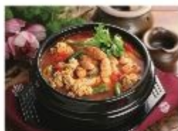
Pollack roe soup