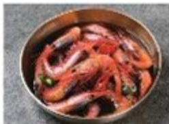
Soy sauce marinated alaska pink shrimp