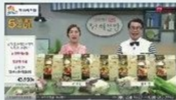
공영홈쇼핑 Gongyoung Homeshopping