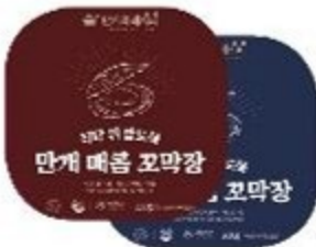
'만개 레시피' OEM