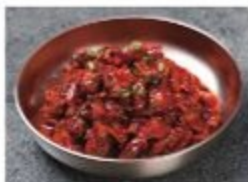
Seasoned spicy cockle