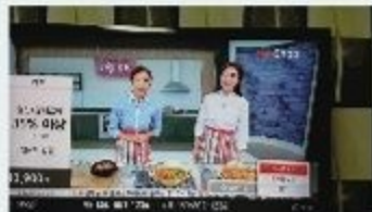
NS홈쇼핑 NS Homeshopping

We are developing new products which are loved by consumers through continuous trend identification.