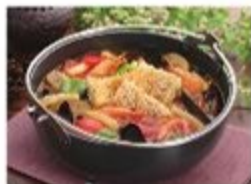
Seafood crust of overcooked rice soup