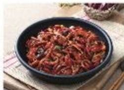
Stir-fried spicy webfoot octopus