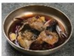
Soy sauce marinated crab (from China)