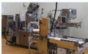
Rotary sealing machine

It raises productivity through automatic equipment so presents a competitive unit price