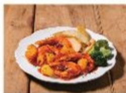
Hot chili shrimp