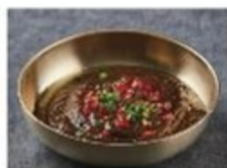
Salted long eye crab with rice