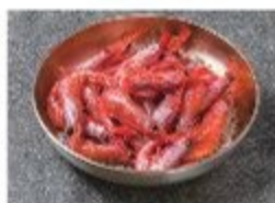
Roasted alaska pink shrimp