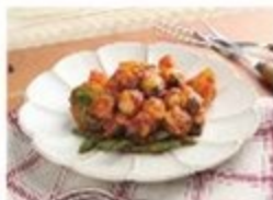
Hot chili scallops