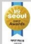
Emblem of HI-Seoul brands award