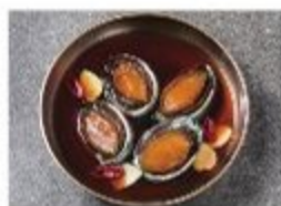
Soy sauce marinated shelled abalone