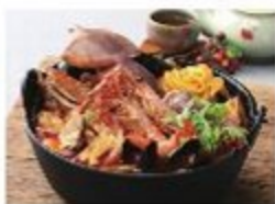
Whole squid spicy seafood soup