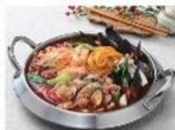
Premium YoungDong-Oyster spicy seafood noodle soup