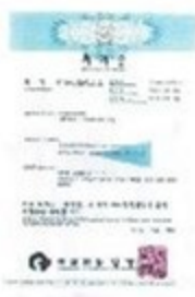
Patent of giant squid / squid processed goods