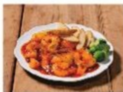
Hot chili Hawaiian shrimp