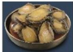
Soy sauce marinated abalone