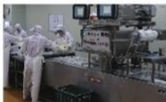
Automatic sealing machine

It is the mission of Youngdong Seafood to realize customer's satisfaction through hygienic and quality control with food safety as the top priority.