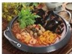
YoungDong-Oyster spicy seafood noodle Soup