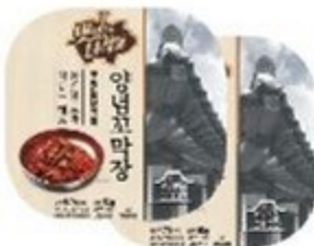
'맛있는 녀석들' OEM