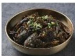
Soy sauce marinated long eye crab (from Korea)