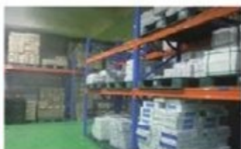
Raw materials and products custody warehouse 1

It is constantly making all-out efforts for safe food that can trust and eat maintaining cleanness from the processing of raw materials.