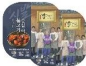
'밥은 먹고 다니냐' OEM

We are constantly striving to provide ONLY ONE products and services that provide health, pleasure and convenience with pride and passion.