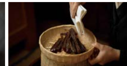
4. Drying at room temperature

Steam the well-simmered bellflower roots to add moisture to the surface