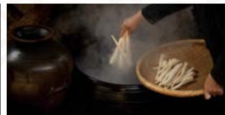
2. 100 hours of simmering

Trim the bellflower roots delicately and gently, following the stem's texture