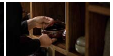
5. Resting and ripening

Slowly dry the bellflower roots at room temperature over an extended period of time