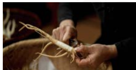
1. Delicate trimming

Trim the bellflower roots delicately and gently, following the stem's texture